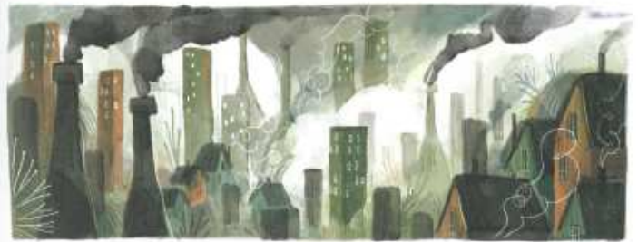
The houses grew into towns and the towns grew into cities. They built factories and shops and cars and planes. They worked all day and all night, until eventually...