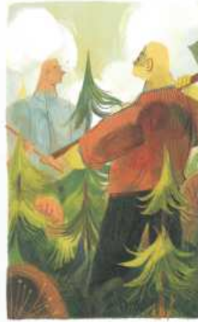
They chopped down trees to build homes.