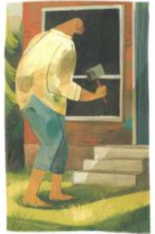
Then they chopped down more trees and built bigger homes.