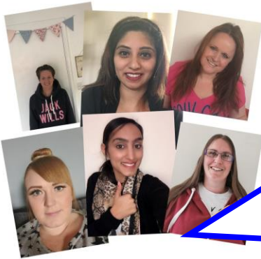
Dunstall Hill Primary Reception Class