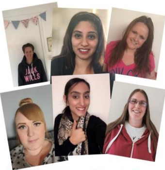
Dunstall Hill Primary Reception Class